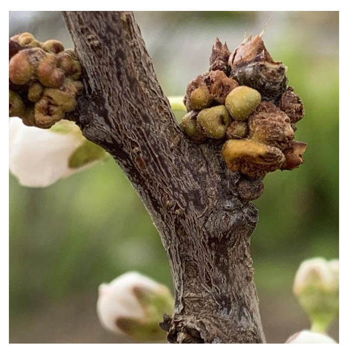
Fig. 2. Infected bud galls in a Golden Nectar plum tree.