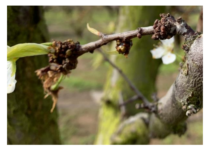
Fig. 5. Flavor Queen Pluot tree with infested bud galls.

decreased yield (seen in almonds in the Middle East), or, in some cases, the death of the tree. In other instances, trees have recovered from the mite attack, and some cultivars are known to be resistant to the mites. Information about plum bud gall mite behavior, impact, and management for North America remains limited.