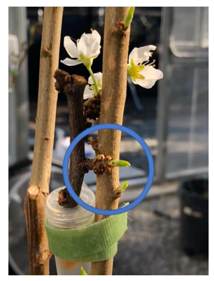
Fig. 6. Plum bud gall mite infested galls place in direct contact with healthy plum branch to ensure transfer of emerging mites onto the healthy tree branches.

In 2020, host range studies were conducted by Karen Suslow (Dominican University, San Rafael, CA). These studies were conducted in nursery stock of five commonly grown almond varieties – Monterey, Padre, Nonpareil, Carmel, Butte, and two commonly grown plum varieties – Santa Rosa and Mariposa. All five of the almond varieties were grafted on Krymsk rootstock. One hundred and twenty-five plum bud gall mite infested twigs with emerging mites were collected from plum trees in San Rafael, CA. Emergence and presence of plum bud gall mite in the galls was confirmed by California Department of Food and Agriculture (CDFA). The plum bud gall mite infested twigs were attached to the healthy almond and plum tree branches. Seven to eight infested twigs were attached to each plum tree and two infested twigs were attached to each almond tree. The galls on the infested twigs were placed in direct contact with healthy almond and plum tree branches